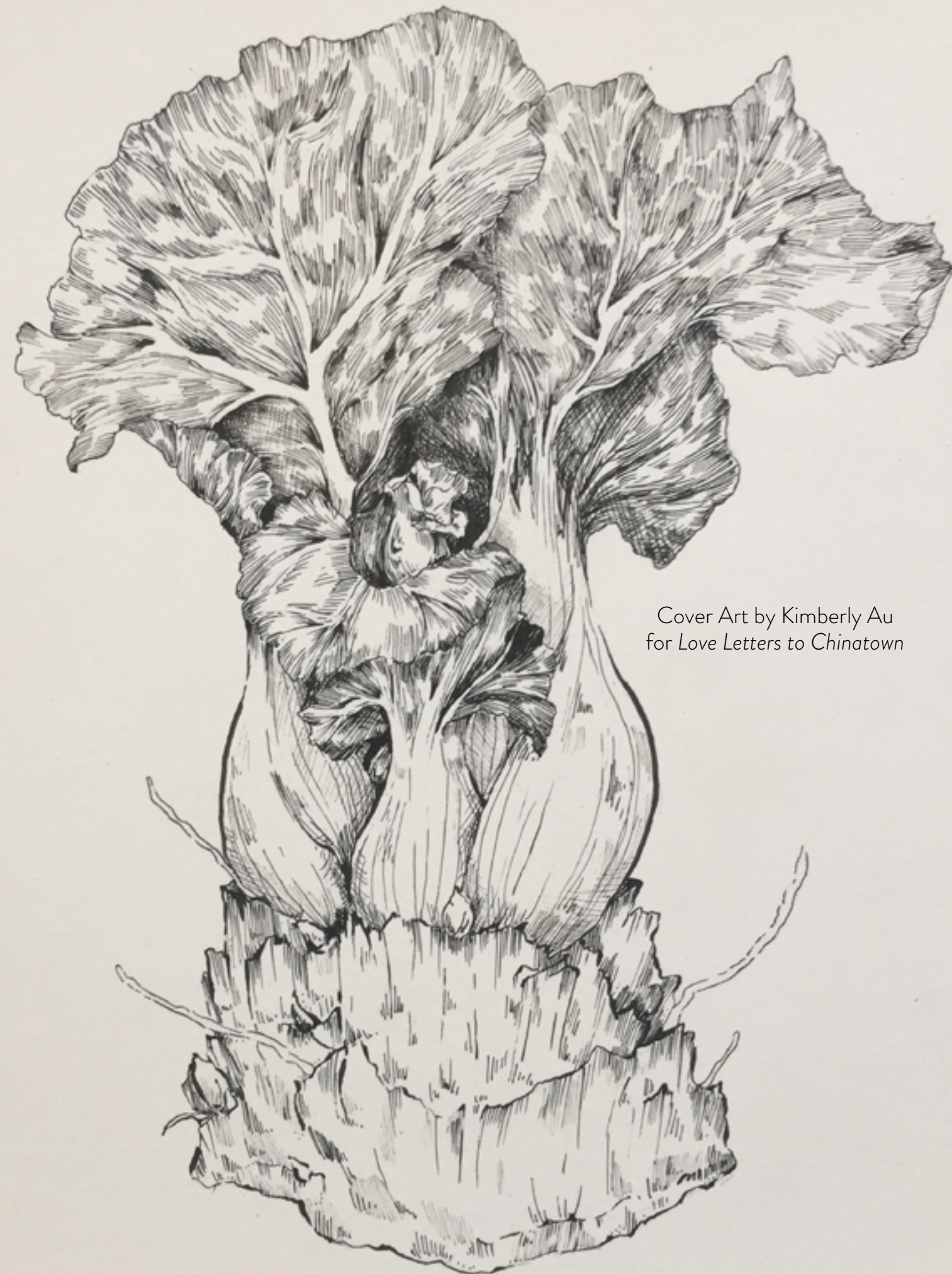
Cover Art by Kimberly Au for Love Letters to Chinatown

cards, or compose a poem by using the number 26. When we have the opportunity to convene as a group again, we will share all of our creative masterpieces. To add a touch of festive care, we conducted wellness calls to remind participants of our celebration and wished the support group a happy birthday.