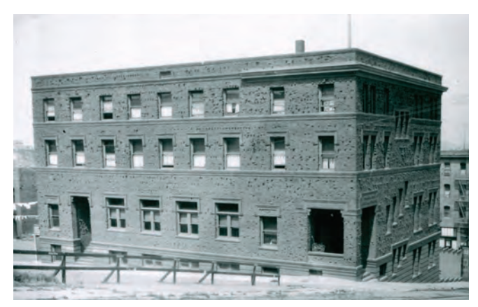
The front of Cameron House still shows its original name as the Occidental Mission Home for Girls.

A brief history lesson: Cameron House was originally founded by the Presbyterian Church as the Occidental Mission Home for Girls. The home's initial purpose was to intervene on behalf of vulnerable young Asian immigrants. Forbidden from legally entering the United States by the Chinese Exclusion Act, these girls and women were smuggled into the country and sold as commodities in what came to be known as the "yellow slave trade".