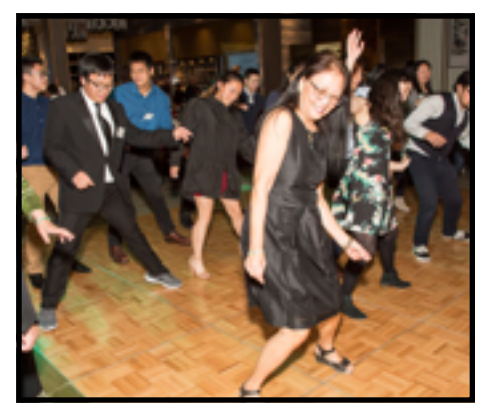
Captions on bottom of page 2