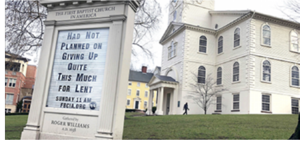
First Baptist Church in America in Providence, R.I. on March 24, 2020