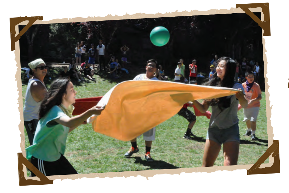
"West is the best week of the summer."

"I have been able to learn so much about the world and myself here."